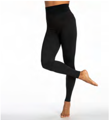
15-20mmHg Legging Size B in Black