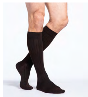
15–20mmHg Closed Toe Calf Size C in Brown 189CC11