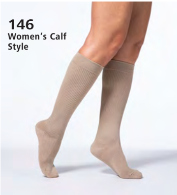
15-20mmHg Closed Toe Calf Size B in Khaki