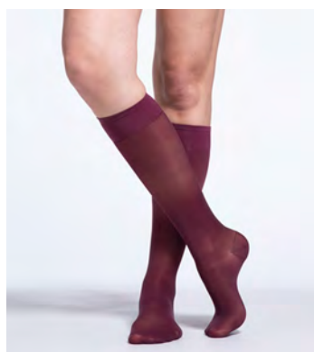
15-20mmHg Closed Toe Calf Size B in Mulberry