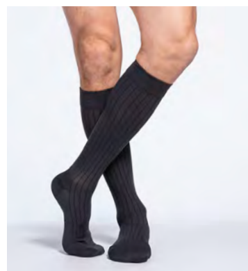
15–20mmHg Closed Toe Calf Size B in Charcoal 189CB12