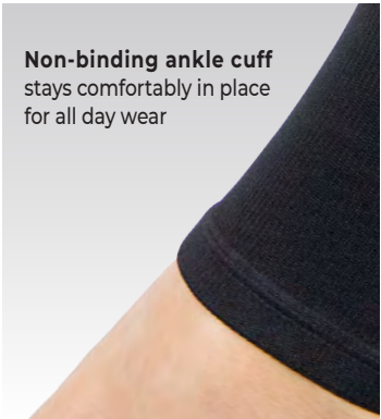
Non-binding ankle cuff stays comfortably in place for all day wear