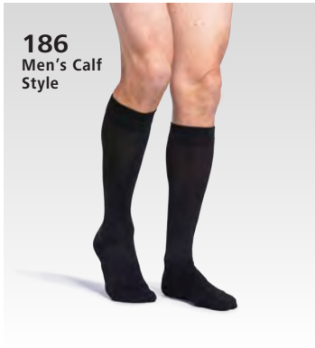
15-20mmHg Closed Toe Calf Size C in Black