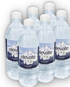
Premium Distilled Water 16.9oz *subject to availability, TSA compliant